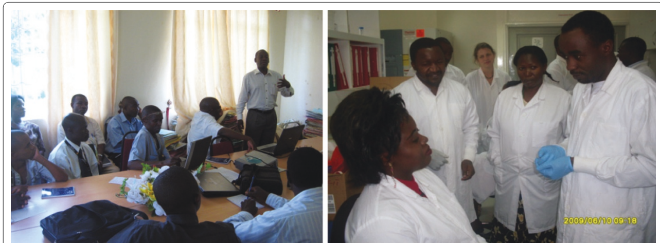
Figure 3. Two week Makerere University, Uganda training for thirty six laboratory scientists from throughout Sub-Saharan Africa.

network partners actively investigated eighteen different outbreaks on U.S. military installations and among defined high-risk groups [17]. These high-risk groups were defined as deployed or deploying personnel, shipboard personnel, new accessions (basic and advanced military trainees and service academy students), health care workers, children and staff in daycare centers and pregnant women. Stressful military environments, highly-mobile missions and complex troop dynamics have proven in the past to help to propagate pandemics and have drawn the attention of the military's operational leadership and leaders of civilian sectors within host countries [18]. These investigations involved anywhere from a few dozen cases to situations where greater than one thousand cases were tested at a given time.