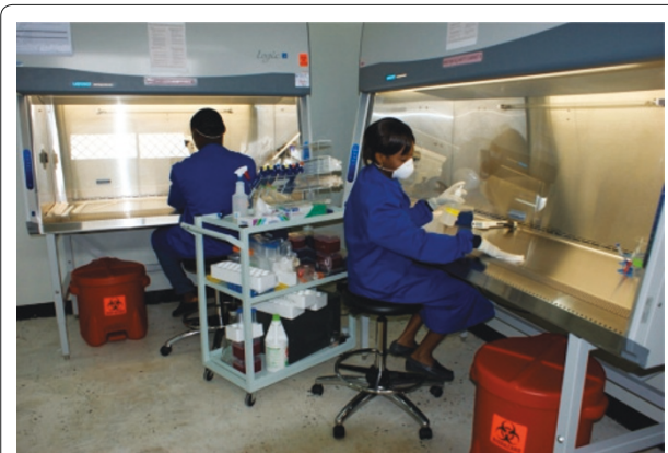
Figure 2. Newly Commissioned Biosafety Level-2 Laboratory at the University of Buea, Cameroon.

Rapid identification of outbreaks and support of timely response efforts are key components of complying with IHR(2005), and are core focus areas of the AFHSC-GEIS network [5,15]. These efforts are provided in response to host country requests for assistance with new or ongoing outbreaks and consists of a wide range of functional support. These support efforts include field team support, epidemiology or consultative support and/or laboratory diagnostic support. These collaborative exchanges strengthen relationships, build and maintain trust and are a critical component of the long-standing relationships built between the network partners and their sponsor host countries. Several of the partnerships between the U.S. and host country militaries (mil-mil partnerships) that have developed over many years have served to empower the host country military's role in supporting outbreak response activities within their own